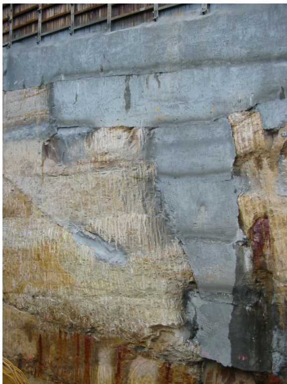
Figure 3: Example of Shotcrete Protection of Pittman LIV Dyke at Excavation Face