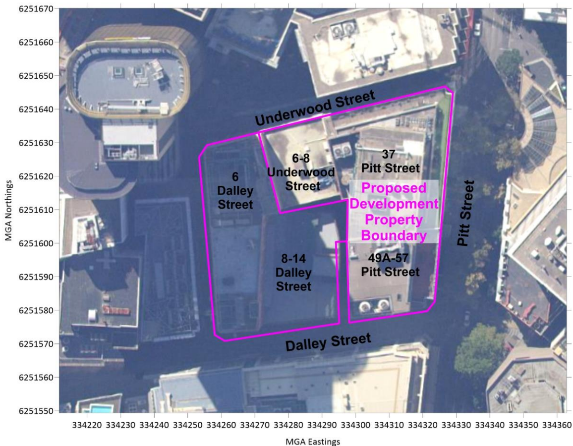
Figure 1: Proposed Pitt Street Development Property Boundary